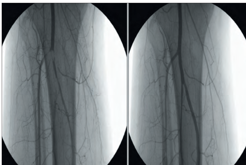
Fig. 1. Angio-imaging of the popliteal trifurcation before and after selective balloon embolectomy.

Transfemoral embolectomy for ALEXI may be performed under local, regional or general anaesthesia via a small groin incision. A small transverse femoral arteriotomy facilitates proximal and distal transfemoral embolectomy using an appropriately sized Fogarty balloon catheter. Intraoperative