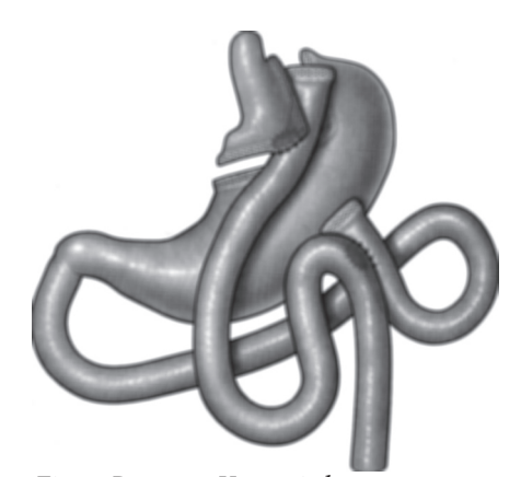
Fig. 1. Roux-en-Y gastric bypass.

Although less commonly performed, sympathectomy and adrenalectomy are eminently suitable for the laparoscopic approach and are now the preferred treatment for hyperhydrosis and most adrenal tumours, respectively. However, large adrenal tumours, most of which are malignant, usually require open surgery.